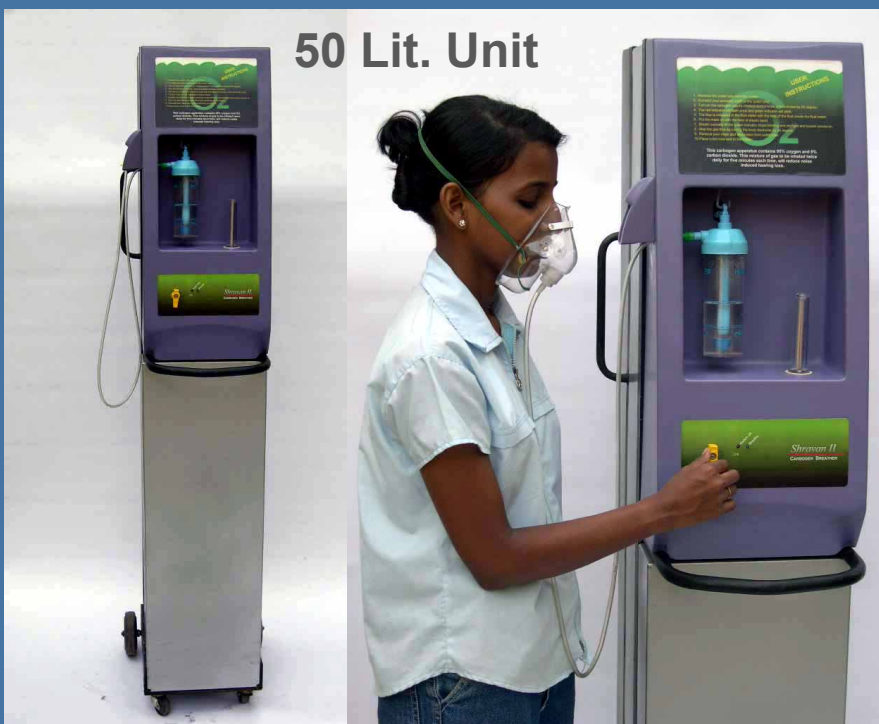
50 Lit. Unit

Defence Institute for Physiology & Allied Sciences DRDO Delhi